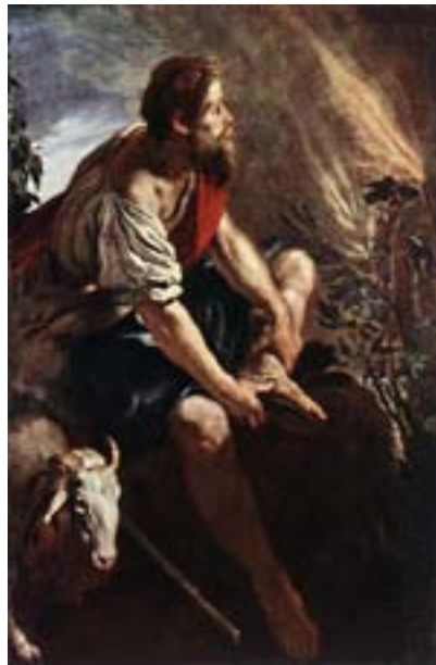
"Moses Before the Burning Bush" Domenico Fetti, 1613