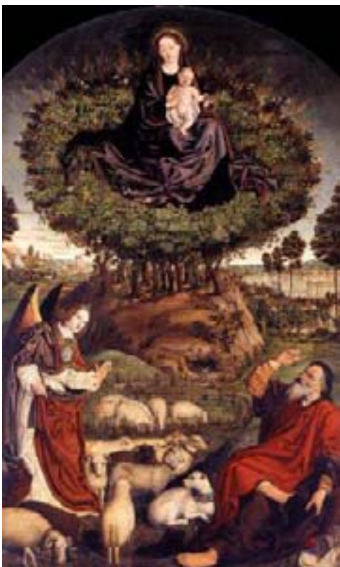
"The Burning Bush" Nicholas Froment, 1476