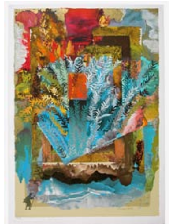
"The Burning Bush" Shraga Weil, 1990